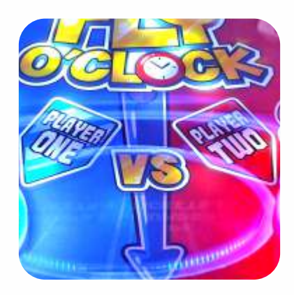
SINGLE OR TWO PLAYER