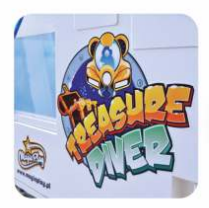
UNDERWATER THEMED CABINET