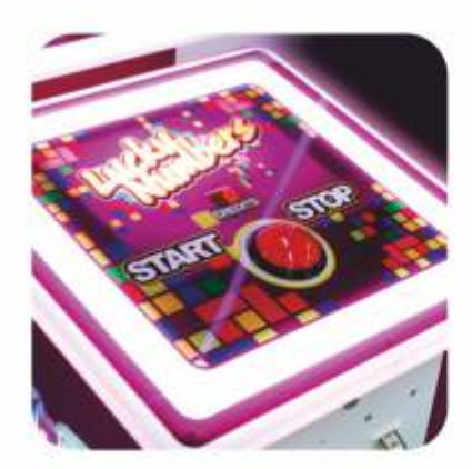
ONE BUTTON TO CONTROL