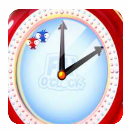
UNIQUE CLOCK THEMED CABINET