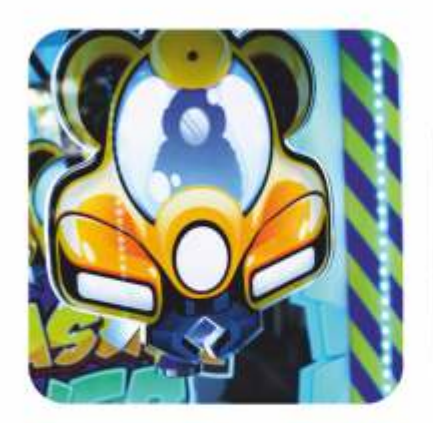
BECOME A SUBMARINE PILOT