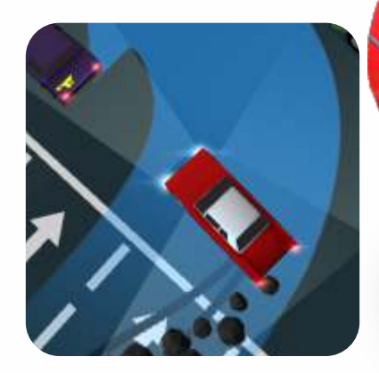
EASY, ONE BUTTON MECHANICS