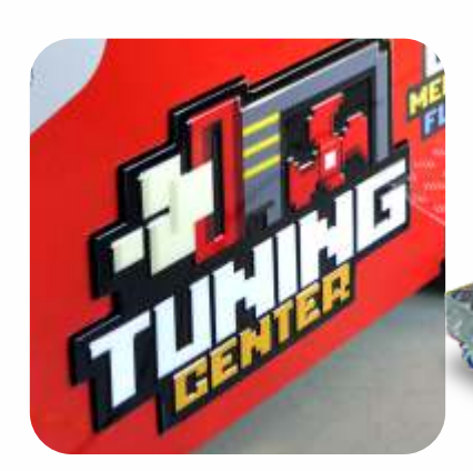
PIXEL THEMED CABINET

Become the car mechanic and repair used cars by... bouncing them around this crazy pinball arena. Collect fuel to drift around the city. Unlock toolshops, buy tools to pimp your car and do other crazy stuff. All of that nicely packed as an old school arcade pinball game with voxel look and feel.