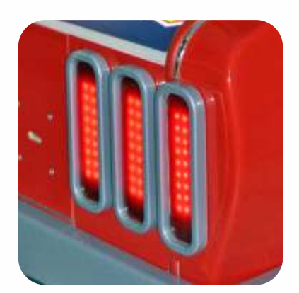
LED REAR LIGHTS