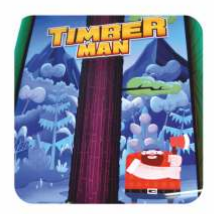
COLORFULL HD GRAPHIC