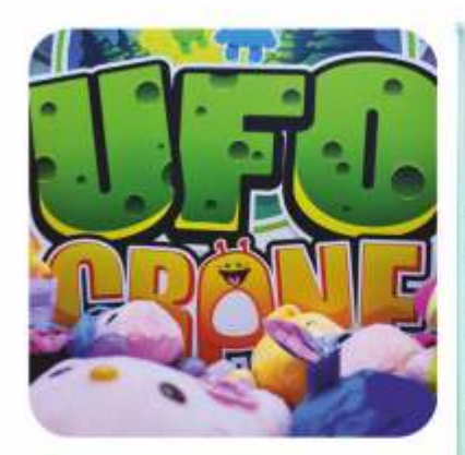
UFO THEMED CABINET