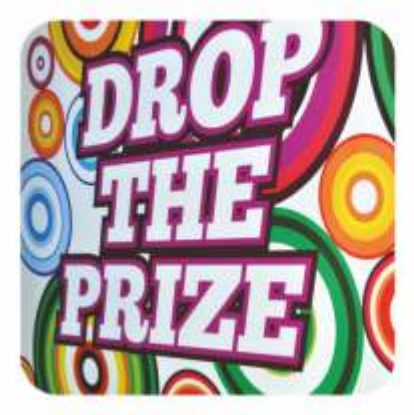
NEW, REFRESHED LOOK