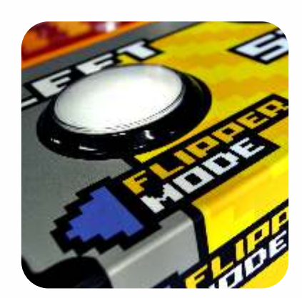
SIDE FLIPPER BUTTONS