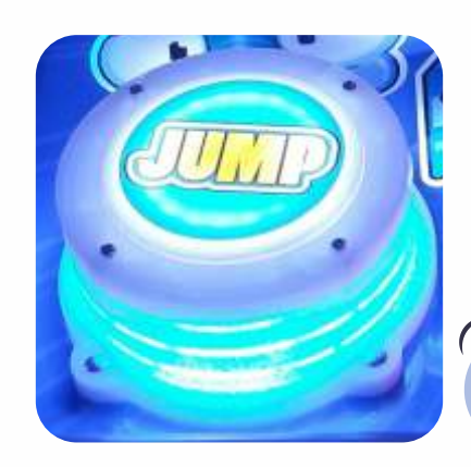
LED ILLUMINATED DETAILS