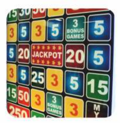
BIG, COLORFUL PLAYFIELD